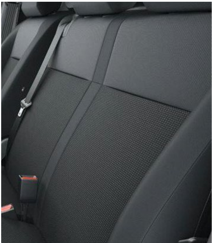
Dark grey fabric (CMFT)

Available in dark grey fabric with a unified black instrument panel that delivers a fresh image.