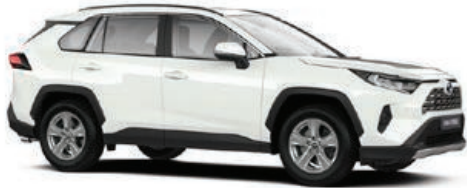
Pure White (040)